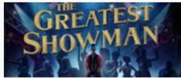
Full Soundtrack to THE GREATEST SHOWMAN Released!