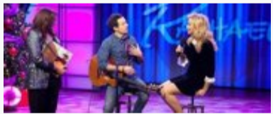
Jason Mraz and Betsy Wolfe Perform on RACHEL RAY