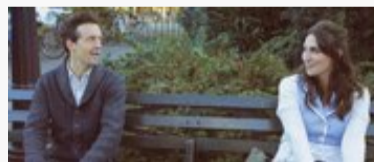
Sara Bareilles and Jason Mraz Release New WAITRESS Music Video