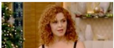
Bernadette Peters Talks Taking Over Lead in HELLO, DOLLY!